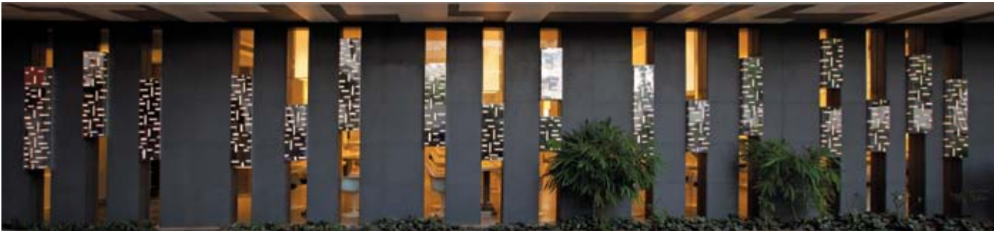
Patrons are greeted with an exterior wall of lights designed by the architects called “Thousand Moons.”