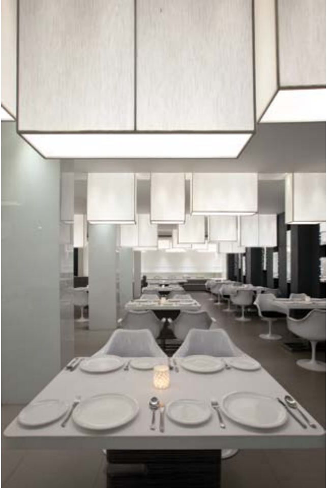
The new waiting lounge offers patrons views of the festivities inside the restaurant.