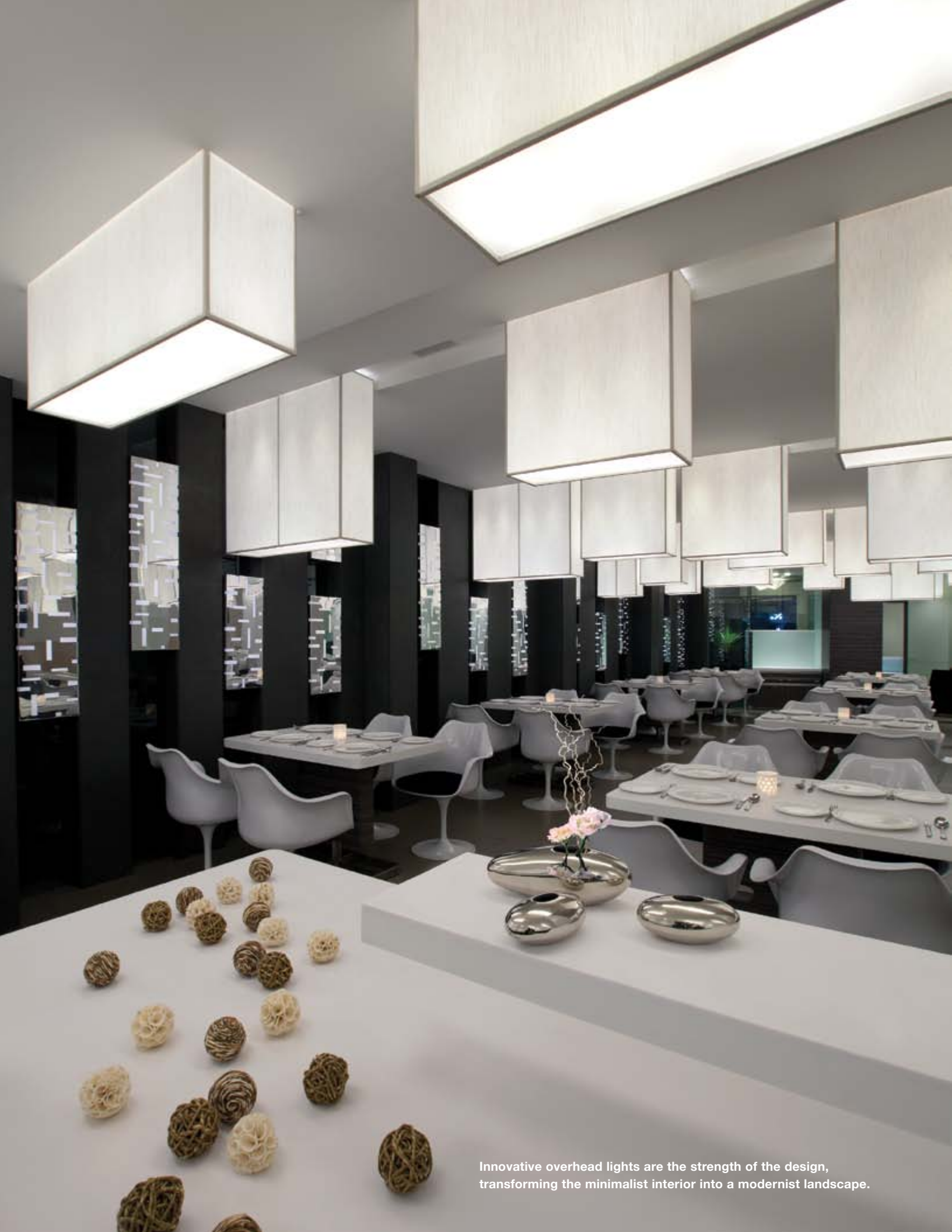
Innovative overhead lights are the strength of the design, transforming the minimalist interior into a modernist landscape.