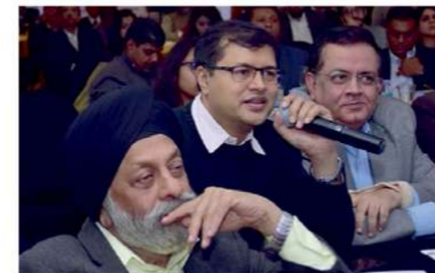
The Q & A session