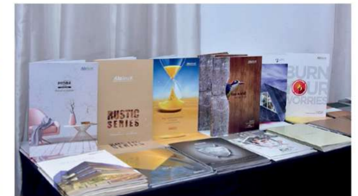
Display of Aludecor's product