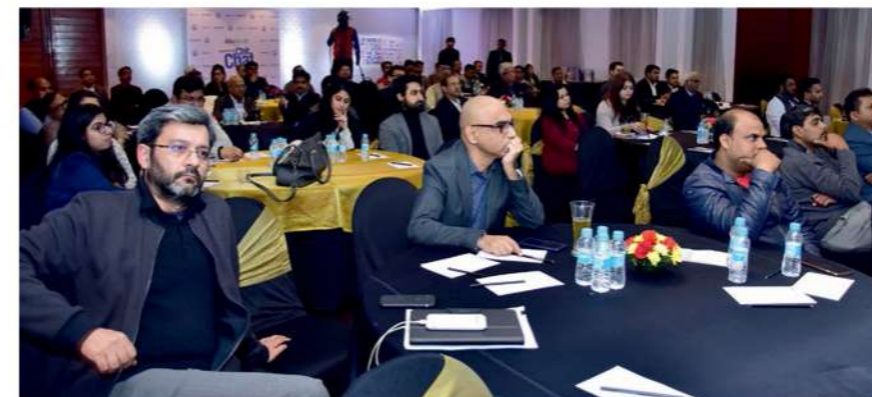
Engaged audience at the event