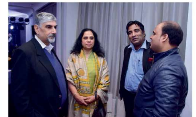
Architects in conversation