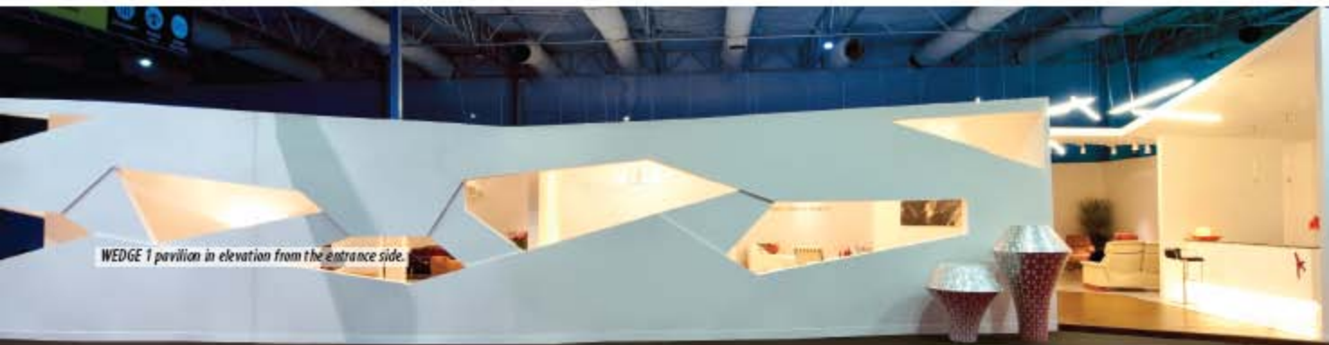
WEDGE 1 pavilion in elevation from the entrance side.

Three elements define the space within: the wrap of the fractured curve, the planes of the ceiling and intermediate planes that segregate spaces and support the overhead plane. "This two-dimensional cut-outs on the skin, transforms the project from a simple container of products to an architectural ensemble of multiple meanings and unparallel perceptual