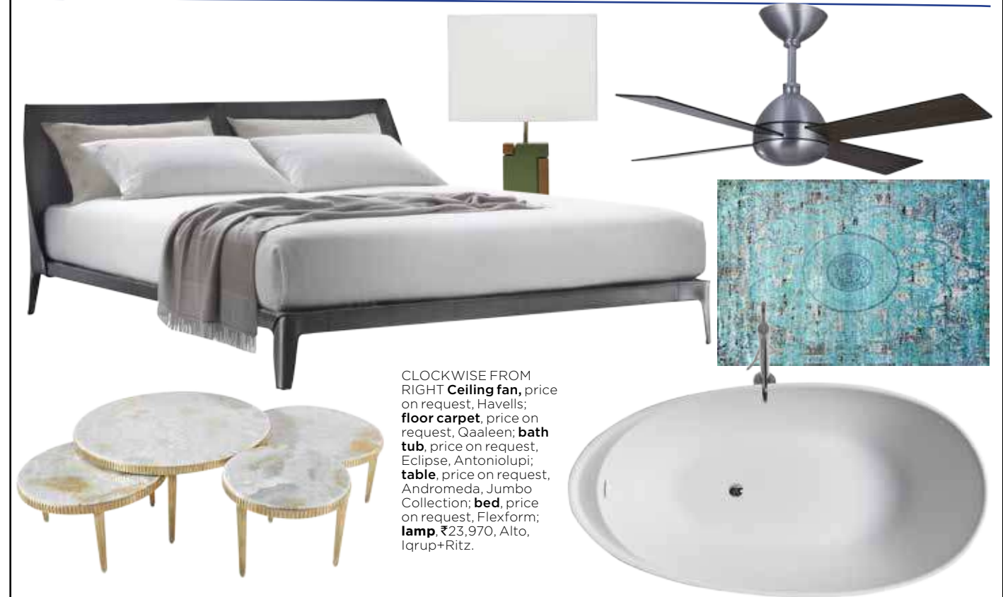
CLOCKWISE FROM RIGHT Ceiling fan , price on request, Havells; floor carpet , price on request, Qaaleen; bath tub , price on request, Eclipse, Antoniolupi; table , price on request, Andromeda, Jumbo Collection; bed , price on request, Flexform; lamp , ₹23,970, Alto, Iqrup+Ritz.